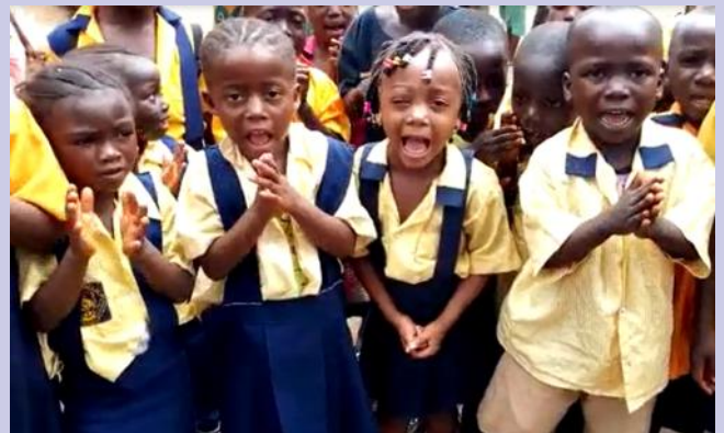
Children singing a song before school starts