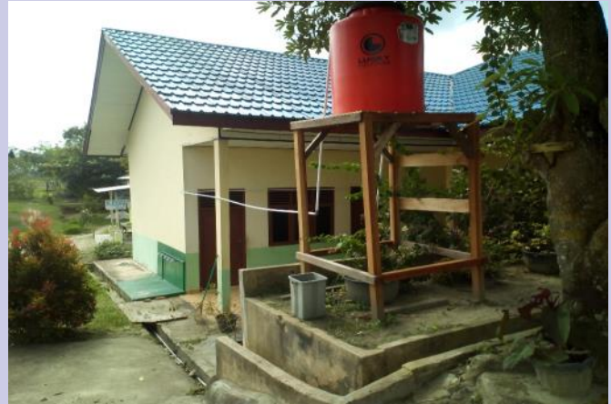
Installing water connection and provided water tank and water tower for supporting dental

In order to support the school's dental program and promote a healthy lifestyle by washing hands and brushing teeth everyday, PT TTI's CDP provided the necessary infrastructure by installing a water connection, water tank and water tower.