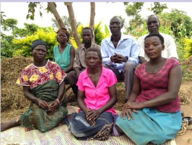
Most participants are small-scale farmers and labourers