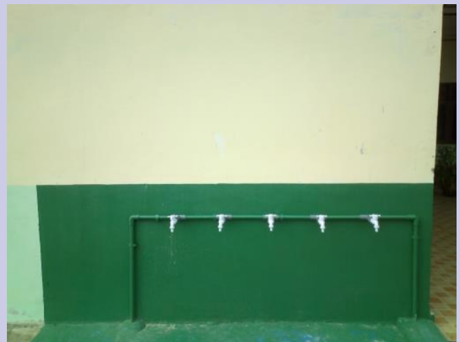
Water connection at Nur Ikhlas Foundation for kindergarten