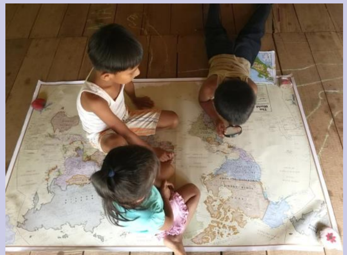
Pre-school children learning about geography