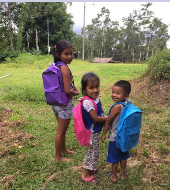
Young students showing off their new backpacks