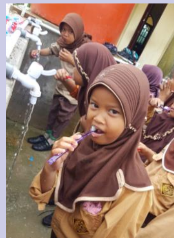
Elementary school students participating in a dental education and treatment program in Indonesia