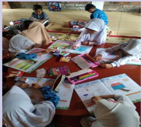
Kindergarten students drawing and coloring

The school has 171 students and 22 teachers. In 2014, the school opened the junior high school program and also received government accreditation.