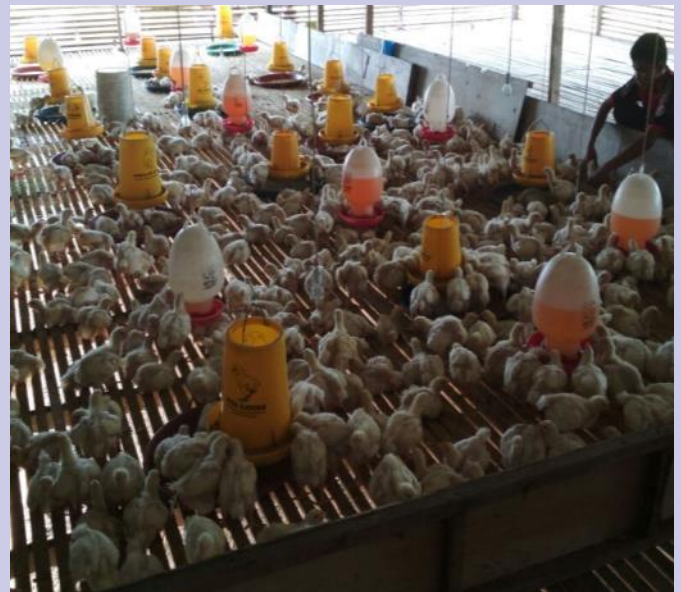
Darunnajah chicken ranch - chickens are 20 days old

Darunnajah School is a boarding school for 250 students, and a home for 25 orphans. This school has elementary, junior, and senior high school students. Students receive funding to attend school from private donors and the government. However, the school still requires additional donors to help cover its operating expenses.