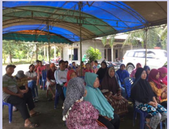
Villagers waiting for consultation and treatment