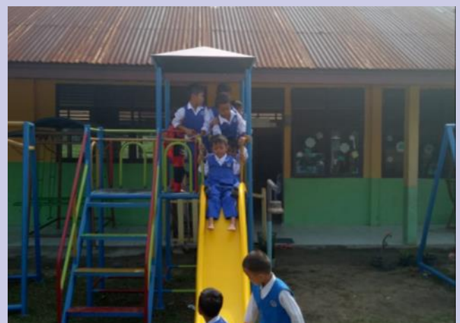
Nur Ikhlas kindergarten children during recess playing in the new playground