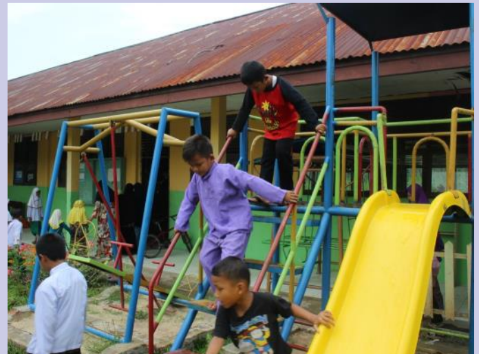
Nur Ikhlas kindergarten children playing in the new playground