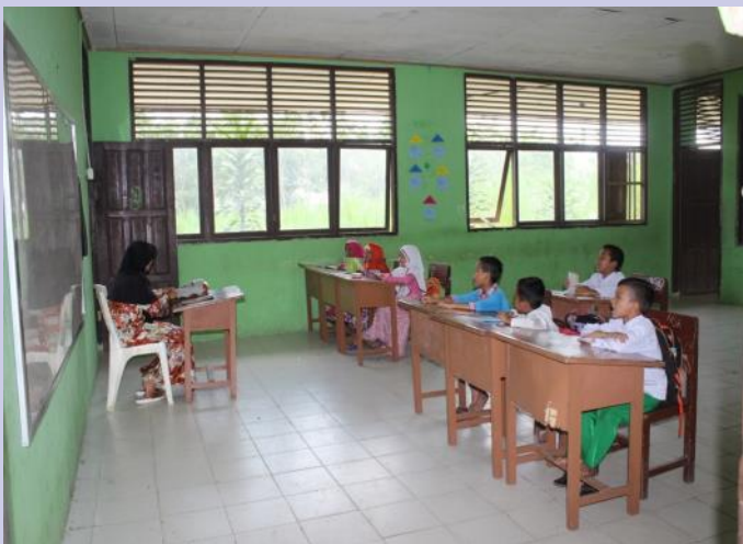
Children learning in the classroom at Nur Ikhlas Kindergarten Foundation