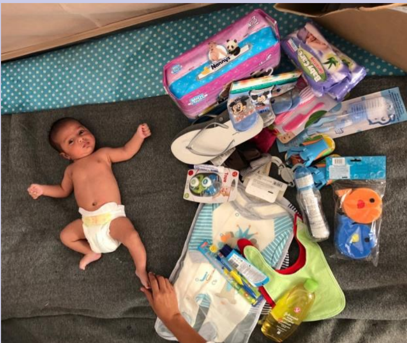
Contents of the Mama and Baby Kits

Everyday Refugees Foundation was formed as an official non-profit organization in July 2017. However, they have been providing support to refugees in Europe for quite some time.