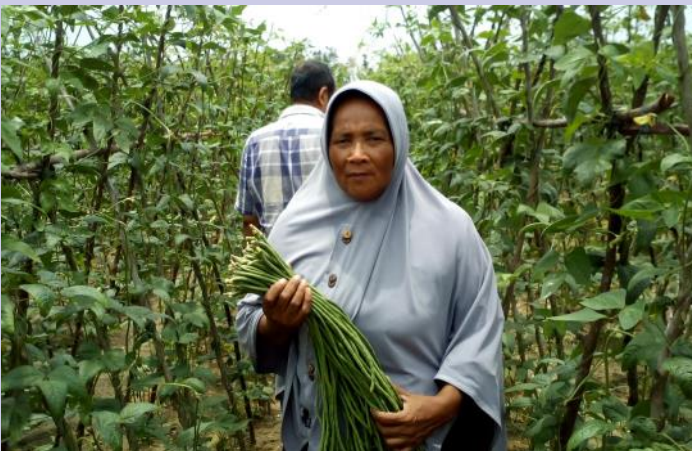
Female farmer showing her long bean crops