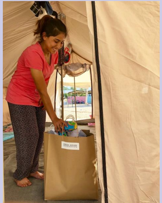
Mother receiving the first Mama kit for her 58 day old baby, after her family fled war-torn Syria.