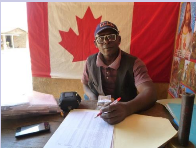
Head teacher signing the payment form for the students' enrollment

Founded in 2012, Freedom Tree is a small Canadian-based, volunteer-run charity that works in Sierra Leone to reduce levels of maternal and infant mortality, one community at a time.