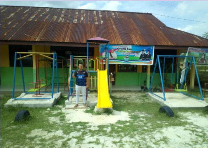
The new playground set at the Nur Ikhlas kindergarten

Nur Ikhlas School is located about 8 km from Duri, and teaches kindergarten, informal Islamic elementary, and junior high classes to 175 students. The school is operated privately without regular support from the government. All students attend school free of charge.