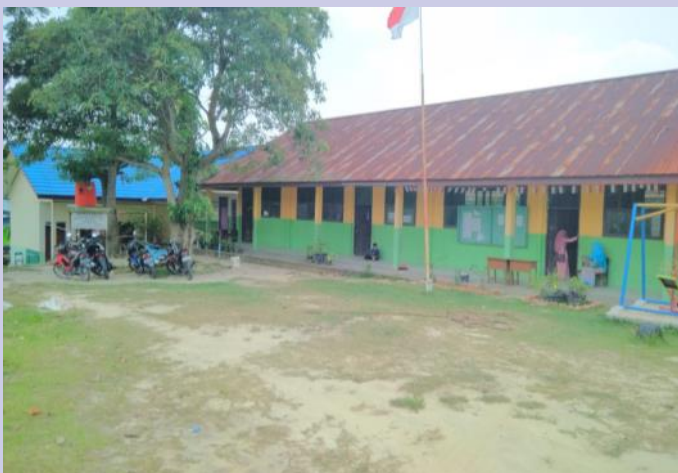
Nur Ikhlas Kindergarten Foundation