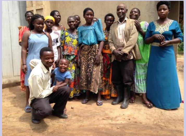
Participants of the Anti-Retroviral Transport Program

Kwagala has several programs, including public health, HIV/AIDS and STI programs, child sponsorship, agricultural programs, and sports and recreation programs.