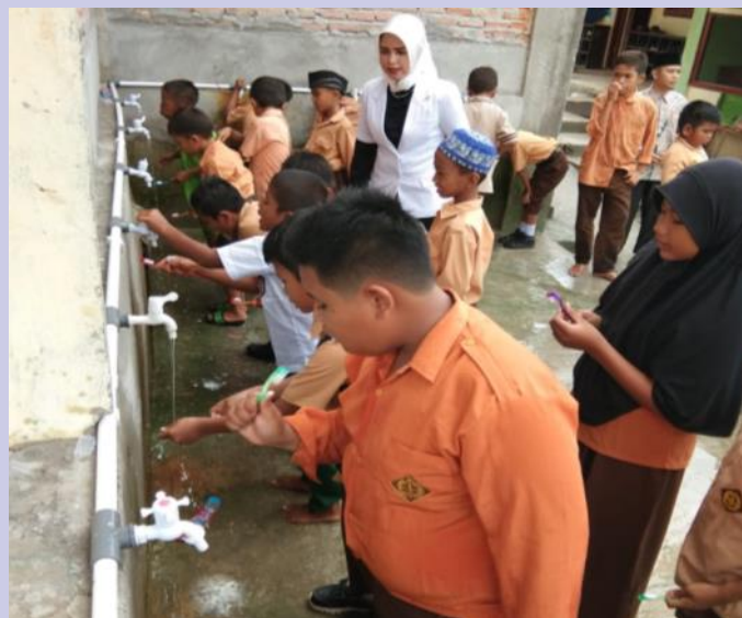
Elementary school students brush their teeth in the morning before classes start