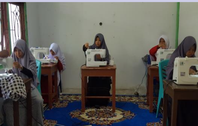
Female students practice using the sewing machine