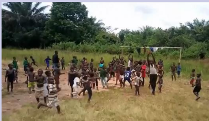
Children of the Kambia community playing at recess