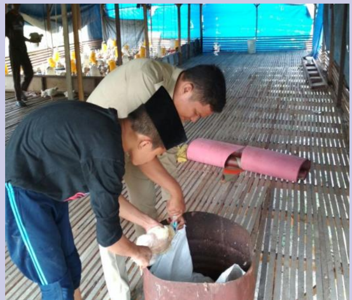
Student and teacher preparing chicken feed