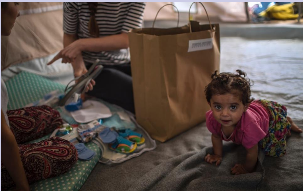
Child from a recipient family of the CDP-sponsored mama and baby kits for Syrian refugees in Greece.