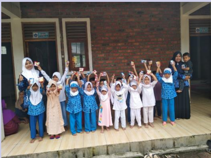
Kindergarten students at Madani School receive their weekly milk and biscuits

Modern Islamic Education of Madani School (Madani) provides three classes in the village of Sindang Lengok, Parakan Salak: