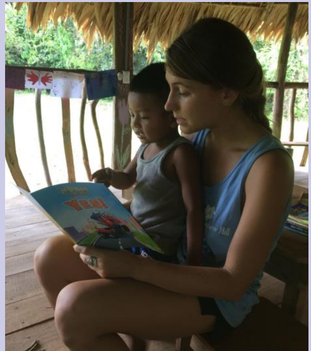
Shakti Seva volunteer reading a story to a pre-school child

Shakti Seva is a small non-profit organization operating in Costa Rica. Through Shakti Seva, volunteers spend three months living with the BriBri and providing daily educational activities to pre-school children in the after-school hours. The volunteers work alongside local elders to create culturally appropriate activities and experiences for children.