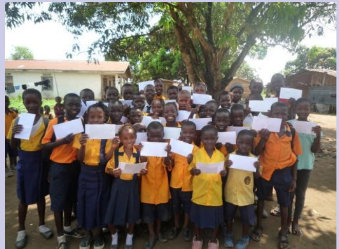
Schoolchildren sponsored by CDP