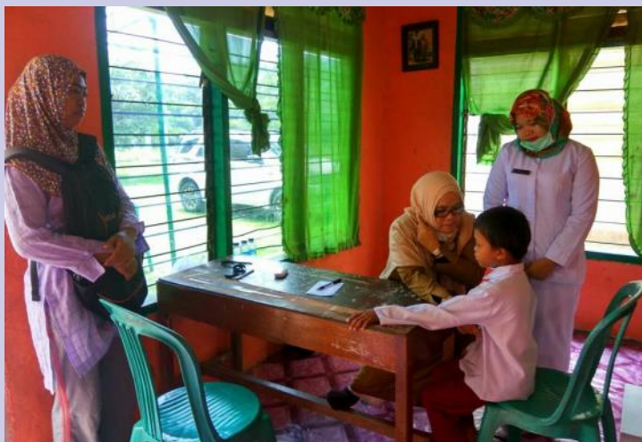
Provision of remote healthcare in Indonesian village