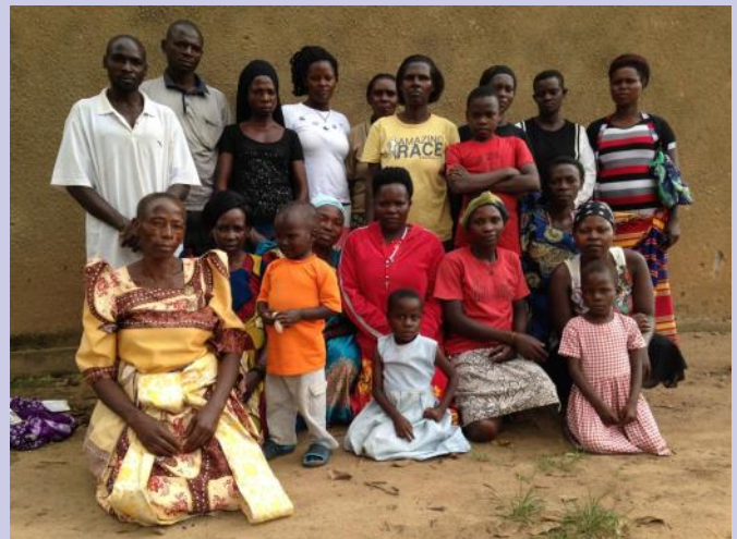
Residents of the Kyababeezi Village, participating in the transport program